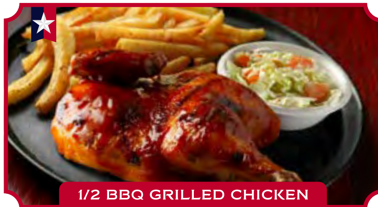
1/2 BBQ GRILLED CHICKEN

Includes two sides: pilaf rice and steamed broccoli.