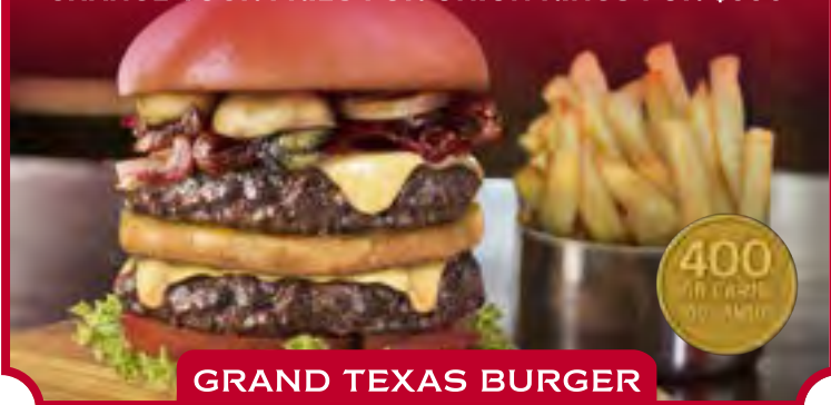
GRAND TEXAS BURGER

CHANGE YOUR FRIES FOR ONION RINGS FOR $990