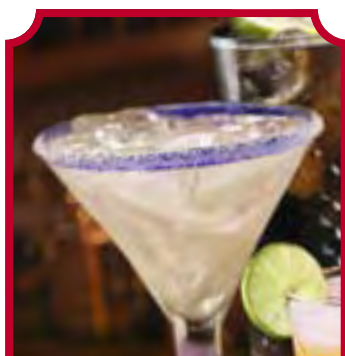
TEXAS CLASSIC MARGARITA