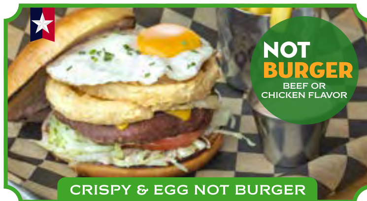
CRISPY & EGG NOT BURGER

Delicious quesadillas stuffed with sauteed mushrooms and corn, nachos on the side, mexican sauce, guacamole and sour cream.