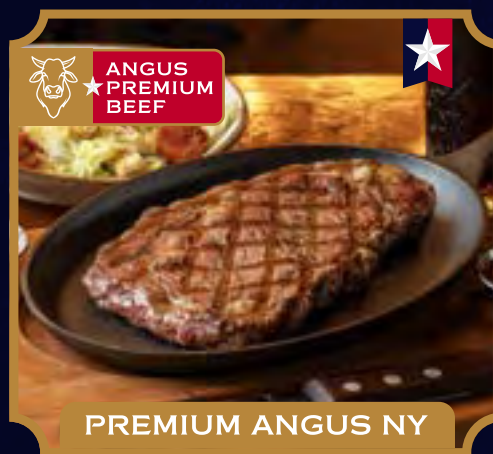
PREMIUM ANGUS NY

Tasty 300g grilled cut of marbled sirloin.