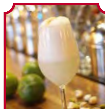
CATEDRAL PISCO SOUR