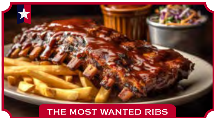
THE MOST WANTED RIBS