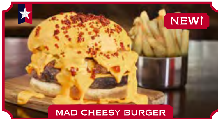
MAD CHEESY BURGER