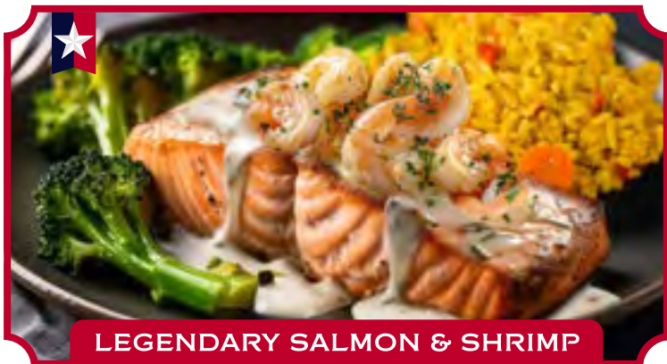
LEGENDARY SALMON & SHRIMP