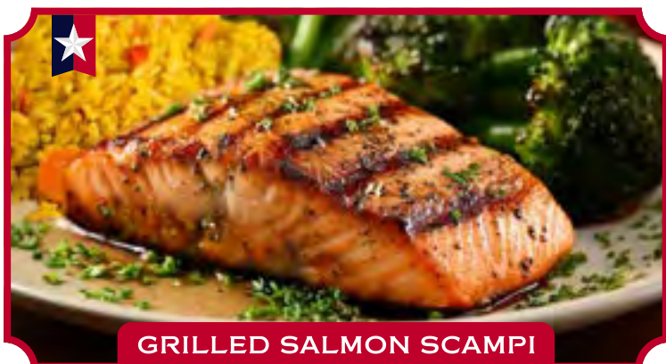
GRILLED SALMON SCAMPI

Grilled chicken fajitas seasoned with Cajun seasoning, sautéed peppers and onions, accompanied by warm tortillas, mixed cheese topping, guacamole and sour cream