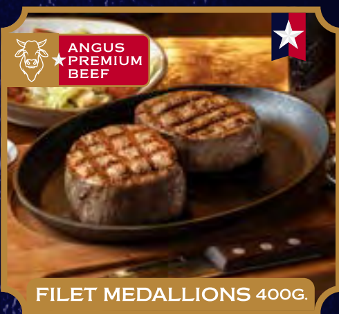
FILET MEDALLIONS 400G.