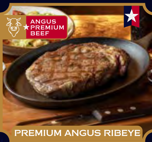
PREMIUM ANGUS RIBEYE