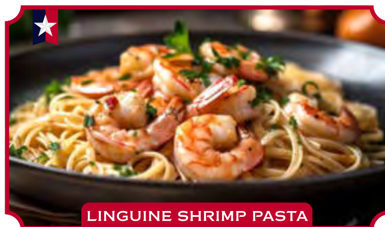
LINGUINE SHRIMP PASTA