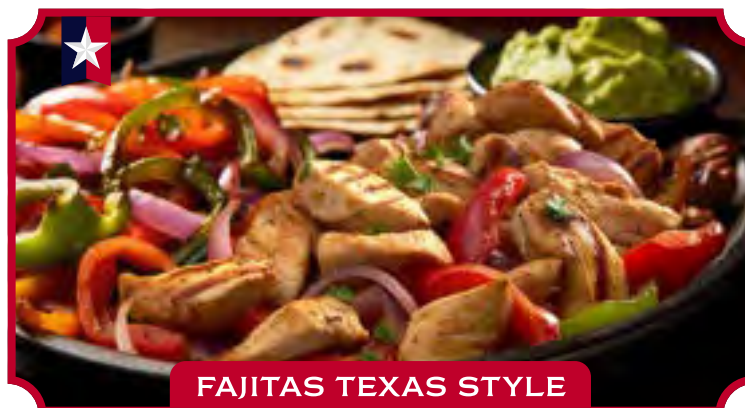
FAJITAS TEXAS STYLE